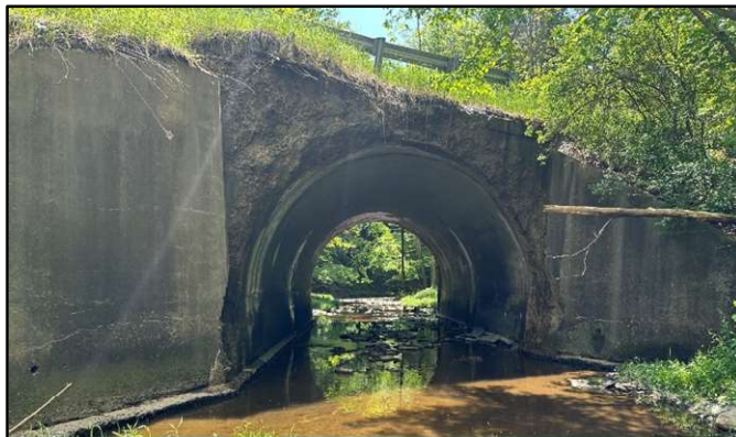
Marshfield Road Bridge over N. Branch Clear